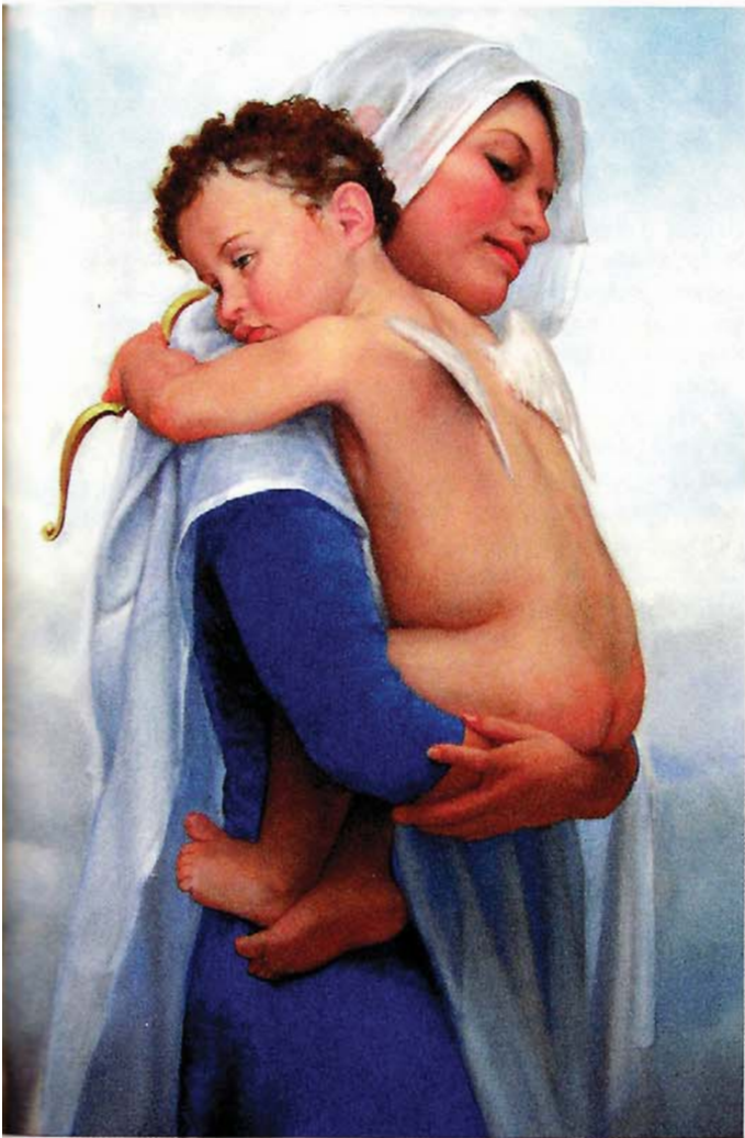
The Weary Cupid , oil on canvas, 30 x 20 in, 2007.

image. "The artist's gift is to illuminate that 'moment between moments'," he concludes.